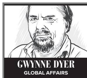
GWYNNE DYER GLOBAL AFFAIRS

1. The clean air over China's cities in the past month, thanks to an almost total shutdown of the big sources of pollution, has saved 20 times as many Chinese lives as Covid-19 has taken. (Air pollution kills about 1.1 million people in China every year.) People will remember this when the filthy air comes back, and want something