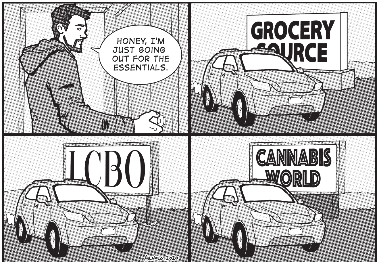
The province knows it can only push so far in shutting down facets of the economy.

OBSERVER WOOLWICH AND WELLESLEY TOWNSHIPS