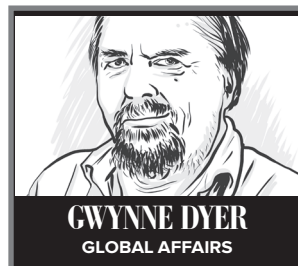
GWYNNE DYER GLOBAL AFFAIRS

The stunning thing about this promise is that it applies to all three million people in Hong Kong – almost half the population – who have British National (Overseas) status by virtue of having been born there before the former British colony was handed back to the People's Republic of China in 1997.